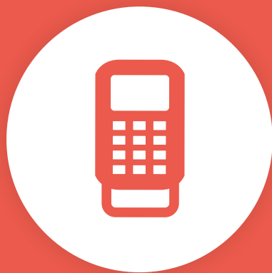
MERCHANT CASH ADVANCE